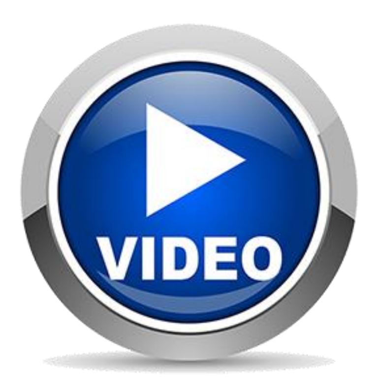
See video at <a href="http://www.ichnfm.org/18">http://www.ichnfm.org/18</a>

"A clinician who is unaware of the political forces that shape healthcare policy and research is analogous to a captain of an oceangoing ship not knowing how to use a compass, sextant, or coastline map. Medical science and healthcare policy are influenced by a myriad of powerful private interests motivated by their own goals, at times different from the stated goal of medicine, which purports to hold paramount the patients' welfare. Scientific objectivity and the guiding ethical principles of informed consent, beneficence, autonomy, and non-malfeasance are subject to different interpretations depending on the lens through which a dilemma is viewed. This gives rise to a disarrayed tug-of-war between factions and private interests, with paradigmatic victory often being awarded to those with the best marketing campaigns and political influence while less importance is given to safety, efficacy, and the economic burden to consumers. To be ignorant of such considerations is to be blind to the nature of research, policy, and our own biased inclinations for and against particular paradigms, assessments, and interventions. Research articles and sources of authority must be approached with an artist's delicacy and with a willingness to consider new information that may contradict deeply rooted beliefs." Dr Alex Vasquez Inflammation Mastery 4th Edition aka Textbook of Clinical Nutrition and Functional Medicine Video gallery: ichnfm.org/18